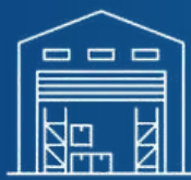
WAREHOUSING & DISTRIBUTION