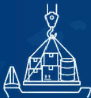
BREAK BULK CARGO