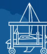
YACHTS HAUL OUT & LAUNCHING