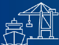
PORT TERMINAL OPERATIONS