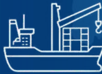
DRY BULK CARGO