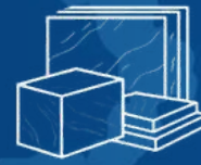
MARBLE AND MARBLE CHIPS